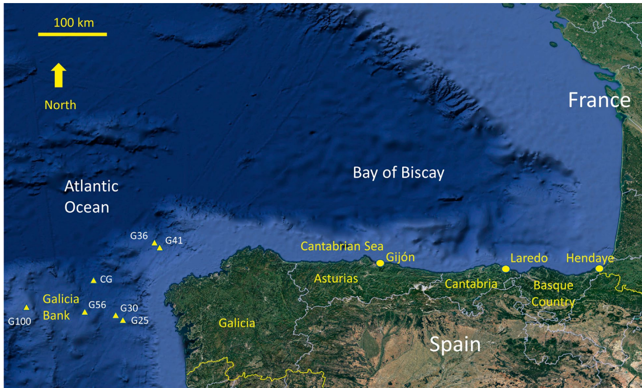
Fig. 1. Map of NW Spain and surrounding seas. Sample localities in yellow, those off the coast of Galicia are indicated by triangles. Note the narrow continental shelf along the western and northern sides of the Iberian peninsula, and the wide shelf along the northern side of the Bay of Biscay. Base map Google Earth.