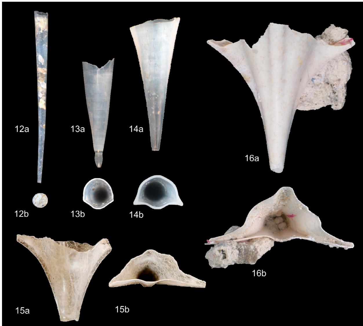
Fig. 12. Creseis acicula (Rang, 1828), Salvé beach, Laredo, Cantabria (S 3957, L 3.2 mm). 12b. Apertural view. Figs 13-14. Styliola subula (Quoy & Gaimard, 1827), Salvé beach, Laredo, Cantabria. 13. Juvenile shell with protoconch (S 3942, L 1.6 mm). 13b. Apertural view. 14. Juvenile shell without protoconch (S 3942, L 2.3 mm). 14b. Apertural view. Figs 15-16. Clio pyramidata Linnaeus, 1767. 15. Half grown, Poniente beach, Gijón, Asturias, leg. AA (AA 0749, L 3.5 mm). 15b. Apertural view. 16. Broken shell of adult, Galicia Bank, OMEX-II.G36, 1522 m (RMNH.MOL.117201, L 5.5 mm). 16b. Apertural view.

expanding, marked carinas that are open on the inside, and a convex dorsal (upper) side (Figs 15b, 16b).