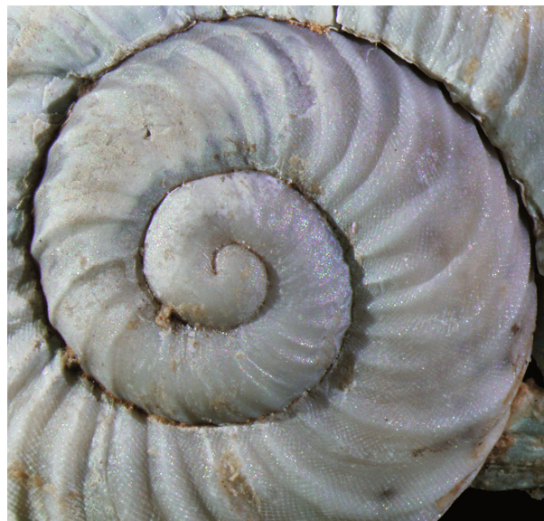
Figure 2. Apex of Canariella gerti n. sp. (Photo: M. Ibáñez).

Canariella gerti n. sp. might be closely related to the recent members of the subgenus Majorata Alonso & Ibáñez, 2006. Being of similar size, Canariella gerti n. sp. shows a combination of features of both living Majorata species in shape and sculpture, viz. roundish but less globose than C. jandiaensis , strongly ribbed, but not keeled like C. eutropis .