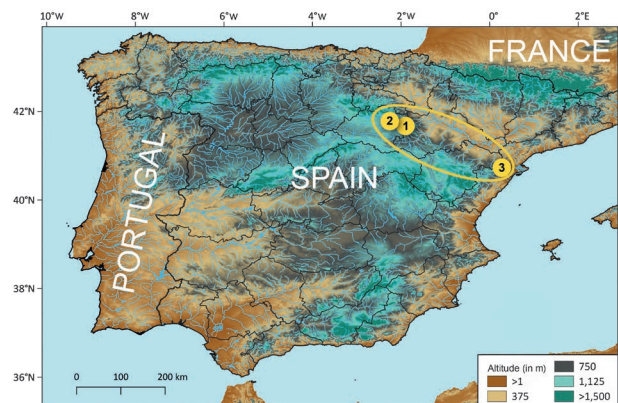
Fig. 11. Geographical distribution map of C. celtiberica in the Iberian Peninsula. 1 = Vieja spring (locus typicus), Ciria (Soria, Spain); 2 = Manubles river, next to “Manantial del Ojo” (Ciria, Soria, Spain); 3 = Rossegadors spring (La Pobra de Benifassà, Castellón, Spain).