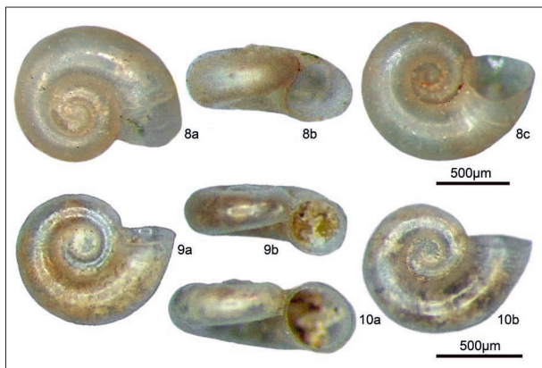
Figs 8-10. Shell of C. celtiberica . 8. Rossegadors spring (La Pobra de Benifassà, Castellón, Spain), MVHN-110714ERO7. 9-10. Vieja spring (Soria, Castilla-León, Spain), MVHN-220420YTO1.