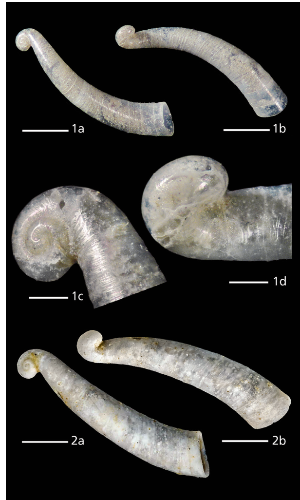
Figs 1-2. Strebloceras taxa. Fig. 1. Strebloceras oliverioi spec. nov., holotype (MZB 60080). Fig. 2. Strebloceras hinemoa Finlay, 1931, syntype (AMNZ AK 70730). Scale bars: 500 µm (Figs 1a-b, 2a-b); 100 µm (Figs 1c-d).

Fossil species include S. cornuoides Carpenter 1859, S. ed-