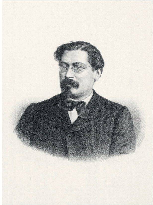
Fig. 2. Portrait of Jules-René Bourguignat reproduced from the portrait (dated 1864) present in the Geneva copy of the first volume of the “Malacologie de l’Algérie” ( http://doc.rero.ch/record/11952/files/mol_r10_1.pdf ).

title (but both the pages and plates are renumbered in the book). The papers in the journal have priority over the parts in the book, but it should be noted that some plates were not published in the journal, but only in the book. In addition, there are a few Aménités Malacologiques that appeared in the book only. An additional complication is that the issues of the journal are not always dated correctly, and that the plates often do not occur together with the accompanying text, but in issues that appeared earlier or later than the text itself. As the plates are provided with a legend on the bottom, new names were sometimes introduced earlier than the original description. Extensive research was needed to allocate the plates to the original issue of the volume of the journal, since plates were as standard bound at the end of the volume, not at the end of the respective issue. With respect to the issues of the journal, there is no information on the wrappers other than the month and year. However, at the end of each issue often the meetings (séances) of that month are described, so that we are able to mention that the number of the journal was published after that date. If for example the meeting of 28