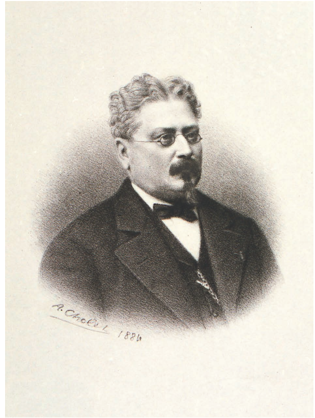
Fig. 4. Portrait of Jules-René Bourguignat present in the Malacological Library of the Muséum national d'Histoire naturelle, dated 1884 (from the heritage of A. Locard). Drawn by A. Cholet in 1884 from the photograph shown in Fig. 3.

of the plates in the issues often do not coincide with the text, and (4) the issues of the journal are not always dated correctly. As an additional complication, the papers in the journal do not carry the heading Les Spicilés Malacologiques , and sometimes the title that appeared in the journal was changed in the book.