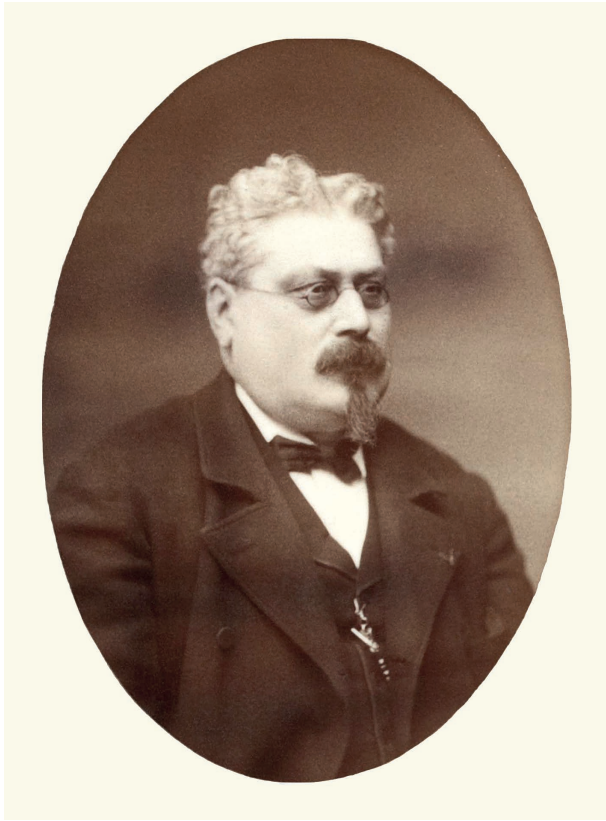
Fig. 3. Portrait of Jules-René Bourguignat (signed 1882 and sent to the Société de Géographie, Paris).